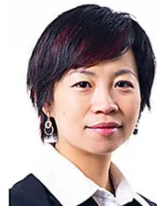
Assistant professor leaves SMU after allegations of faked claims surface May 06, 2022

( https://www.businesstimes.com.sg/global-enterprise/china-property-sector-still-reeling-despite-the-easing-of-some-2020-curbs?obOrigUrl=true )