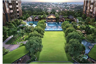
Bukit Sembawang starts previews for Liv @ MB; units priced from S$1.08m to S$3.63m May 06, 2022

( https://www.vestiairecollective.com/journalist-acquisition-earnings/?utm_source=Outbrain&utm_medium=Native&utm_campaign=newsinterestdesktoppost )