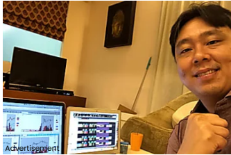
Here's Why I Know The Markets Will Soon Recover wealthacademyglobal.com

( https://www.businesstimes.com.sg/real-estate/mountbatten-road-conservation-bungalow-up-for-sale-with-s636m-price-tag?obOrigUrl=true )