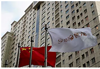
China property sector still reeling despite the easing of some 2020 curbs May 10, 2022

( https://www.businesstimes.com.sg/global-enterprise/china-property-sector-still-reeling-despite-the-easing-of-some-2020-curbs?obOrigUrl=true )