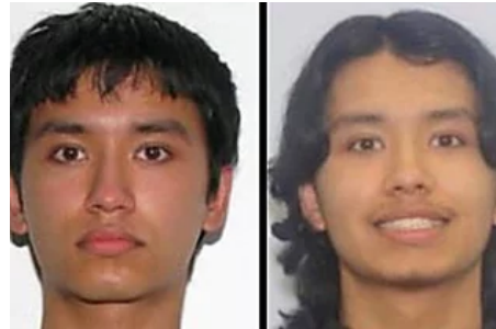
Gunman takes own life after wounding 4 near elite Washington prep school, police say April 23, 2022

( https://www.businesstimes.com.sg/real-estate/heaton-appoints-former-mp-lee-bee-wah-as-independent-director?obOrigUrl=true )