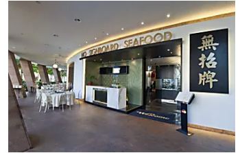
No Signboard terminates loan agreements with Q&M CEO, private investor May 04, 2022

( https://www.businesstimes.com.sg/real-estate/bukit-sembawang-liv-mb-previews-for-liv-mb-units-priced-from-s108m-to-s363m?obOrigUrl=true )