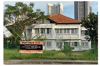
Mountbatten Road conservation bungalow up for sale with S$63.6m price tag May 04, 2022

( https://www.businesstimes.com.sg/markets/penny-stock-crash-mastermind-soh-and-quah-found-guilty-of-most-charges?obOrigUrl=true )