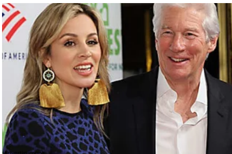
Richard Gere Finds a Buyer for His $28-Million Estate in Upstate New York Mansion Global

( https://ad.doubleclick.net/ddm/trackclk/N7118.1984505?obOrigUrl=true )