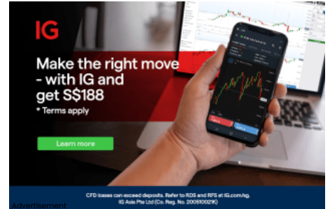
Now till 30 Jun: Open a Trading Account and Get S$188. *T&Cs apply IG Asia

( https://www.businesstimes.com.sg/government-economy/gunman-takes-own-life-after-wounding-4-near-elite-washington-prep-school-police?obOrigUrl=true )