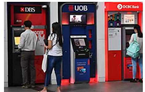
Singapore banks raise promotional rates in race for deposits April 28, 2022

( https://8822ef.l1sdzktxnwnr.com?subid=$section_name$&adtitle=2022+Credit+Cards+That+Don't+Require+a+Credit+Check+May+Surprise+You+in+Singapore+and+Rise+Promotional+Rates+in+Race+for+Deposits?obOrigUrl=true )